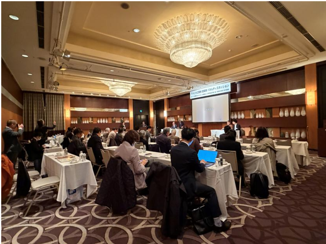
Fifty attendees : Mainly architects, Designers , Lumber wholesalers