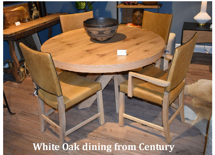
White Oak dining from Century

The High Point Market Authority said it was the strongest spring market since Covid with attendance estimated up 1% from last April. HPMMA officials said the number of larger retailers attending market increased 2% from the spring and the number of new buying companies is up 13.8% from last fall, representing more than 1,600 ac-