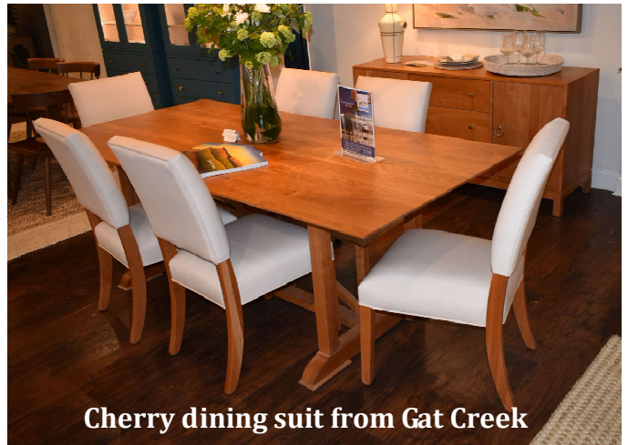
Cherry dining suit from Gat Creek

Cherry was seen in other showrooms and exhibitors said buyers had interest in the natural and brown finishes. Designers said the look of cherry and new finishes were attracting retailers and interior designers.